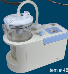
Item # 48110