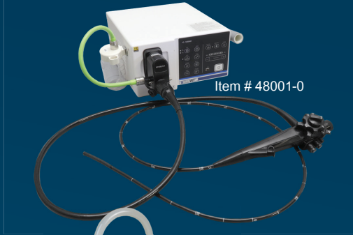
Item # 48001-0