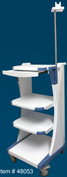
Item # 48053

Purchase 1 MDS-Vet™ HD Video Endoscope System and 1 Endoscopic Cart (Item # 48053) & Receive 1 DV-350 Surgical Suction Unit (Item # 48110) FREE