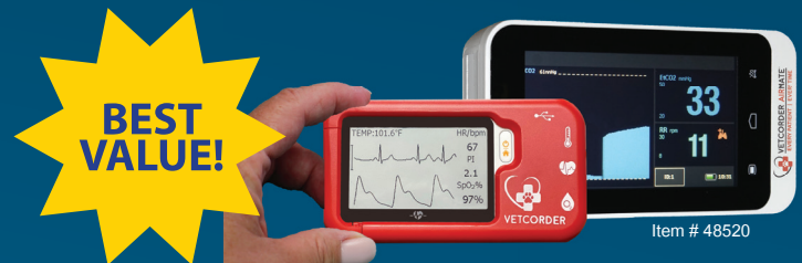
Item # 48520

Purchase 1 Vetcorder™ Pro / Vetcorder Airmate™ Combo (# 48562) & Receive 1 Additional Sensor (ECG - # 48533), Carrying Case (# 48543), Vetcorder Airmate™ Protective Boot (# 48531) and a 5/Pack of Moisture Filters for Vetcorder Airmate™ (# 48552) FREE